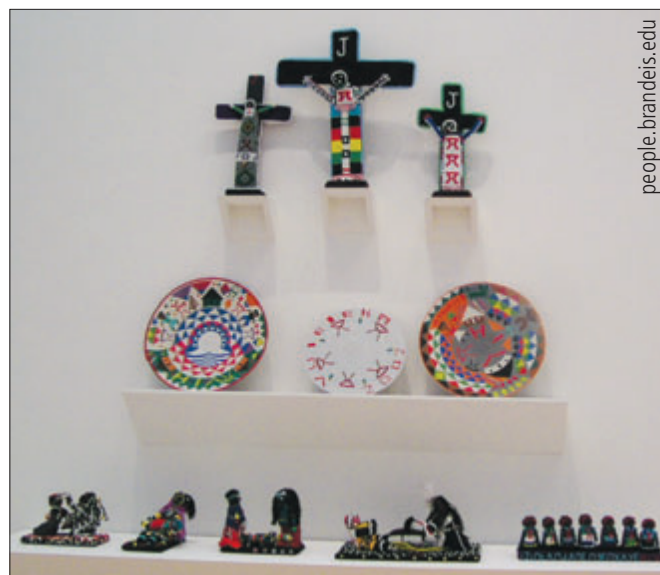
AIDS crosses: From the Siyazama Project (1999-02) by Zach Goldman